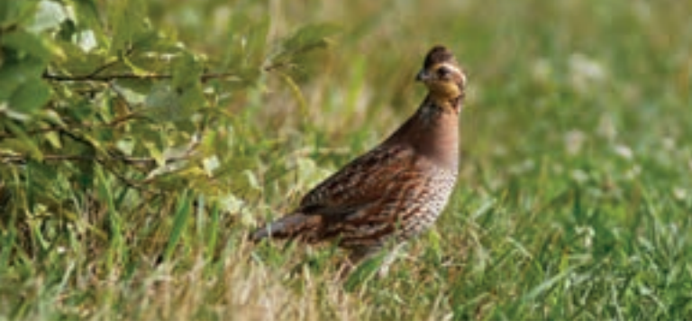
Bobwhite Quail.