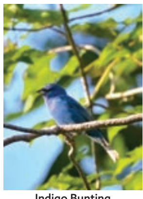
Indigo Bunting