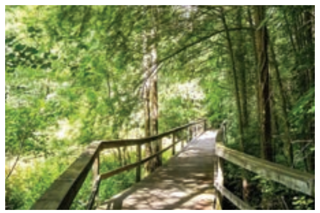
Adkins Mill Park